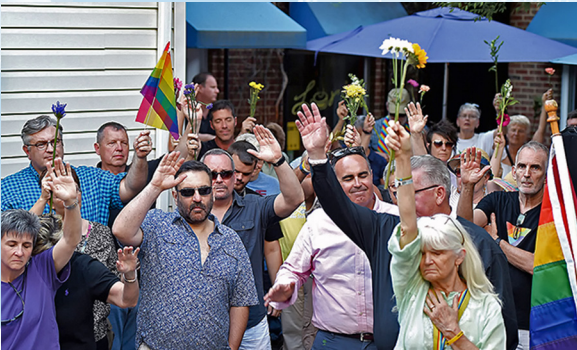
Vigil after Orlando Shooting