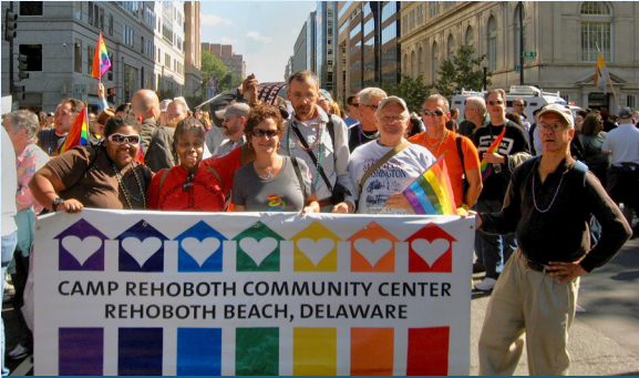
Equality March on Washington