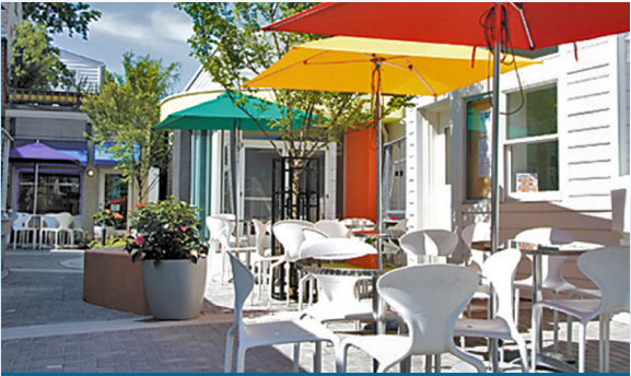
CAMP Rehoboth Community Center Courtyard